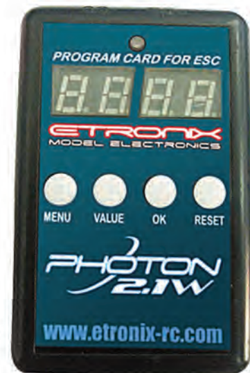
Optional LED programming card

Default settings are shown in the grey boxes